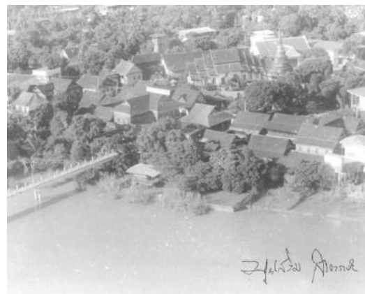
Wat Ket District: Shop building, the old district of Chinese merchant community from Bangkok. In the age of boat trade (Scorpion Tailed Boat) 100 years ago, saw the top of the Wat Ket Pagoda in 1967. https://www.topchiangmai.com