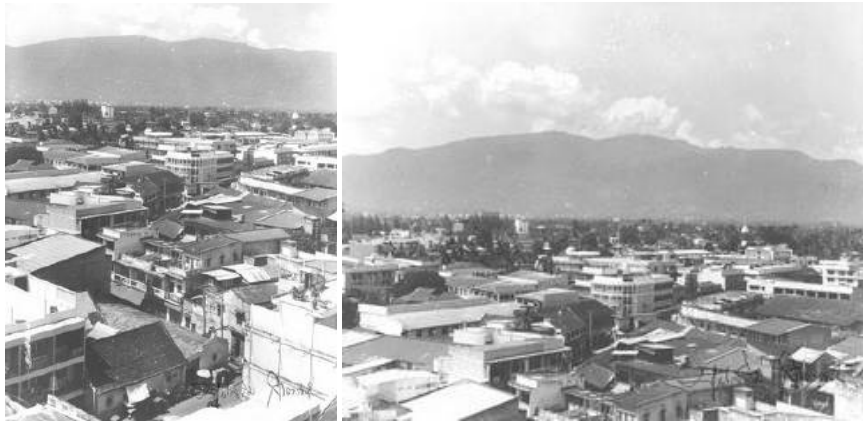
Aerial photograph Around Warorot Market and Punta Khao Kong Shrine in 1972 https://www.topchiangmai.com

In 1774 the then Lanna King with assistance from Siam finally drove the Burmese out of the Lanna Kingdom. The Lanna Kingdom eventually became part of Siam in 1892. The Lanna Kingdom was gradually dissolved and condensed into a 20,000 km 2 area centered around Chiang Mai. In 1932 the whole Chiang Mai area officially became a province of Siam. In 1949 Siam officially became known as Thailand.