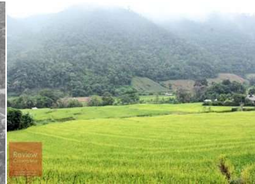
Capital of the North City of the Million rice fields