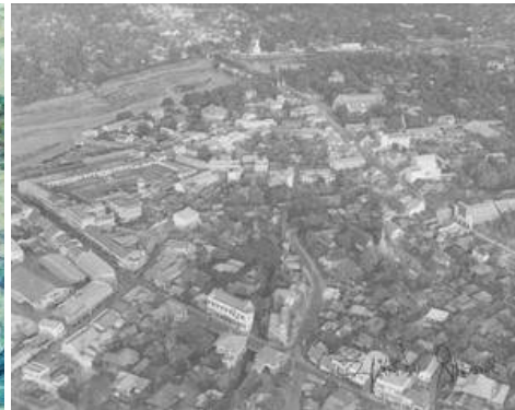
Aerial photograph To the left of the picture is Kad Luang.