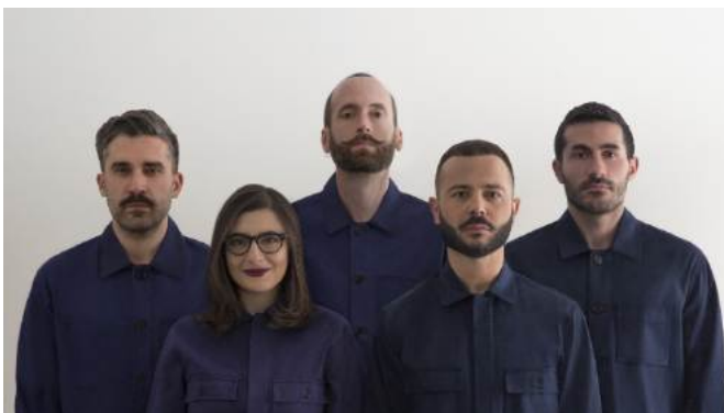
2019 Best Performance Award Winner, FORO Studio

“ADF Milano Design Award 2020” Entry : https://pro.evalato.com/1374