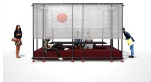
2019 award-winning work, “TOMI”