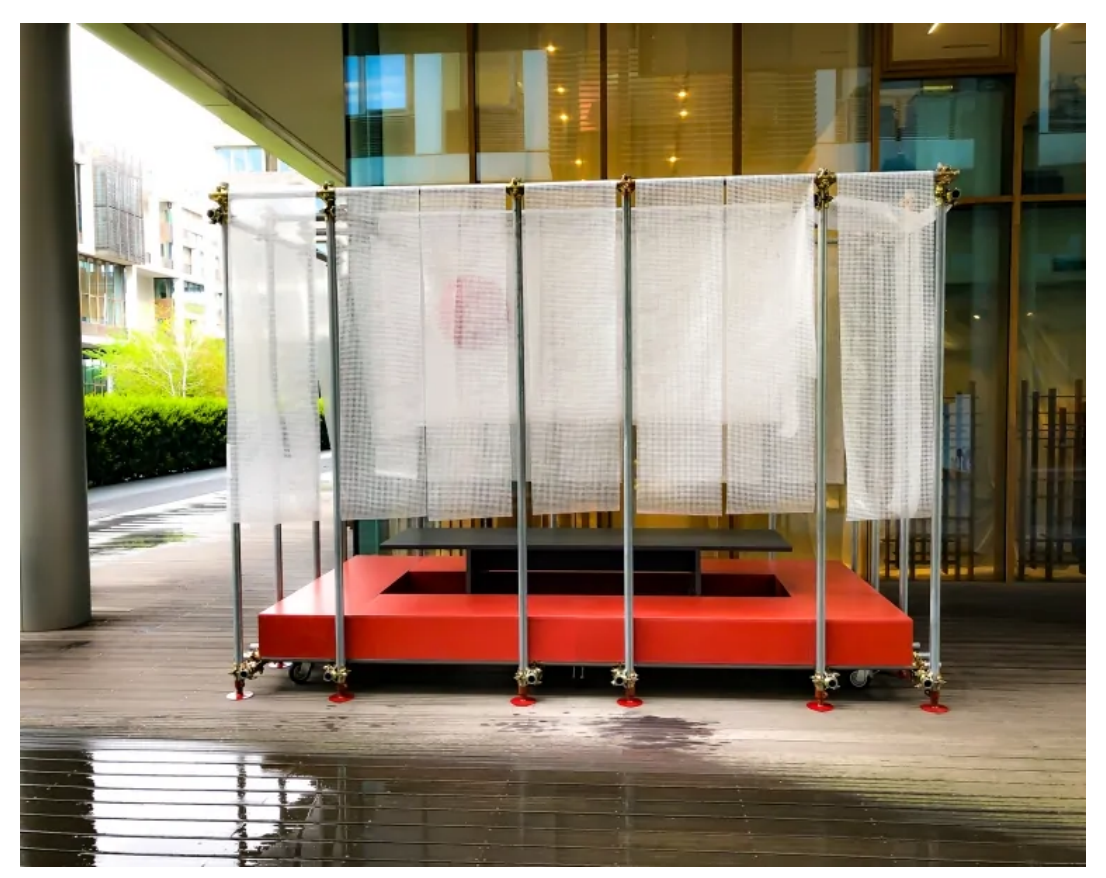
2019 award-winning work "TOMI" by FORO Studio