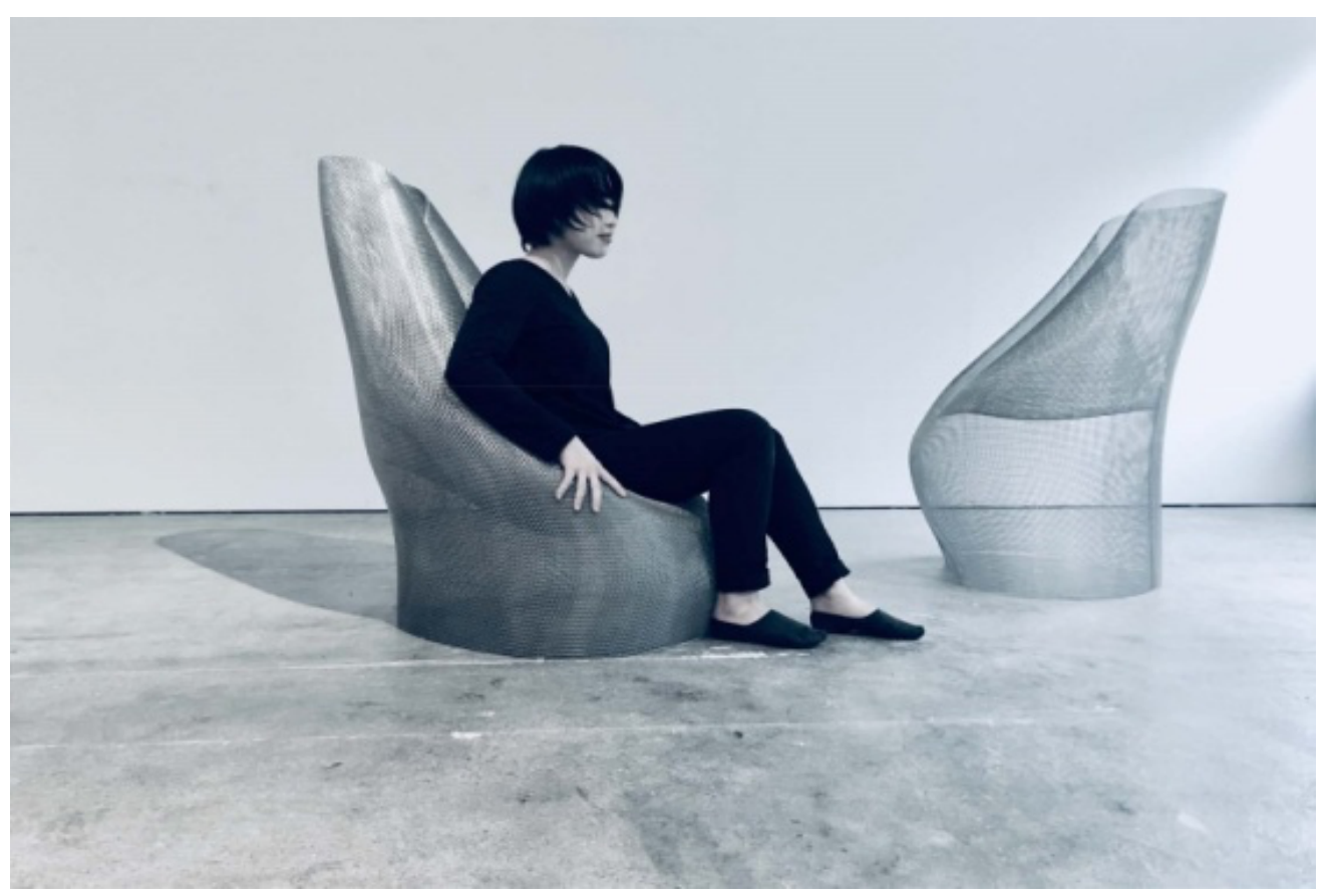
2020 award-winning work "CYLINDER x MATERIAL" by Rie Aruga